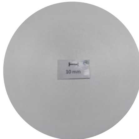
Macrosection, d178 mm: Segregation 3,1 mm

Depending on the process, a segregation zone occurs immediately in the marginized layer of continuously cast billets. Prior to further processing these should be removed – this is already the case for the turned billets from LEICHTMETALL. Additionally these billets are also subjected to a final quality test by means of an automatic ultrasonic test underwater. In the case of casting lengths, the depth of the segregation zone is shown by way of example at 178 mm.