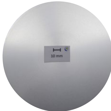
Macrosection, d178 mm: Segregation zone 2,1 mm

Depending on the process, a segregation zone occurs immediately in the marginalized layer of continuously cast billets. Prior to further processing these should be removed – this is already the case for the turned billets from LEICHTMETALL. Additionally these billets are also subjected to a final quality test by means of an automatic ultrasonic test underwater. In the case of casting lengths, the depth of the segregation zone is shown by way of example at 178 mm.