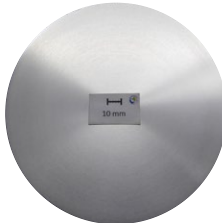
Macrosection, d178 mm: Segregation 2 mm

Depending on the process, a segregation zone occurs immediately in the marginalized layer of continuously cast billets. Prior to further processing these should be removed – this is already the case for the turned billets from LEICHTMETALL. Additionally these billets are also subjected to a final quality test by means of an automatic ultrasonic test underwater. In the case of casting lengths, the depth of the segregation zone is shown by way of example at 178 mm.