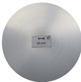
Macrosection, d178 mm: Segregation zone 2,7 mm

With our T6 Material this layer is already removed, so that the whole bolt can be used. Please refer to the Data Sheet EN AW 6082 for the surface pictures.