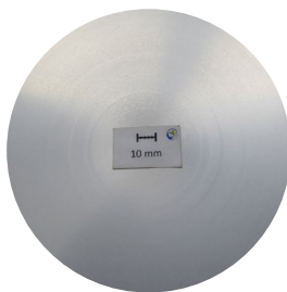
Macrosection, d178 mm: Segregation zone 2,7 mm

With our T6 Material this layer is already removed, so that the whole bolt can be used. Please refer to the Data Sheet EN AW 6082 for the surface pictures.